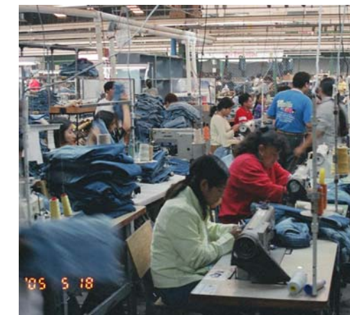
Inside an apparel assembly plant in Guatemala. This is only a small portion of the huge plant.

The Spanish translation of El Salvador Sustainable Living Wage/Income report is now available. It will be used by Salvadoran worker organizations and justice advocates. Both the Guatemala and El Salvador studies are made possible through the generosity of CREA's donors,