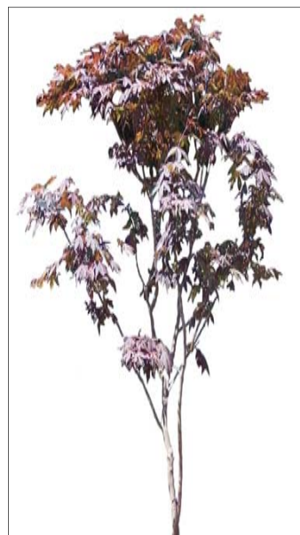
A young tree thrives on the disintegrating roots of a beloved old tree in front of CREA House. It is a daily reminder of life and hope.

NONPROFIT ORG. US POSTAGE PAID HARTFORD CT PERMIT NO. 2969