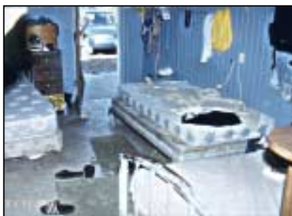
Six workers each pay $25 a week for these living quarters, six beds crammed into one room.

CREA encourages readers to support the farm workers' efforts by bringing this situation into public conversation, and joining in whatever way possible in their struggle for justice.