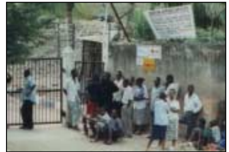
Kenyans wait in front of a fashion apparel facility in an Export Processing Zone in Mombassa.

This first PPI study will set a baseline of information about workers' purchasing power and will enable future studies to calculate whether the anticipated economic benefit of this trade agreement for Africa will actually reach the Mombassa workers and their families.