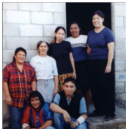
Craft Cooperative Members. El Salvador. Fair Trade products offer an alternative to the “Free Trade” approach of current trade deals.

CAFTA negotiations were completed for a Free Trade Agreement between the US, El Salvador, Nicaragua, Honduras and Guatemala. The final text of the agreement will be available at an unspecified time in January. According to the US trade representative, the agreement opens up all services in these countries to US businesses, while including some US concessions.